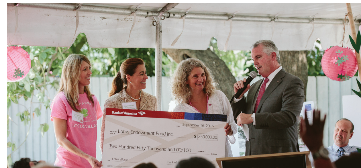
Bank of America makes $250,000 challenge grant to launch Lotus Village.

With the help of hundreds of supporters attending the Lotus Village public hearings over many months, thousands of hours spent by alumni gathering neighborhood petition signatures, and countless support letters from public officials, service providers, collaborating agencies and all of you, LOVE prevailed! And Lotus Village broke ground on September 15th amidst a sea of beautiful children and pink lotus flowers! Our heartfelt thanks to everyone for your dedication, perseverance, extraordinary support and LOVE!