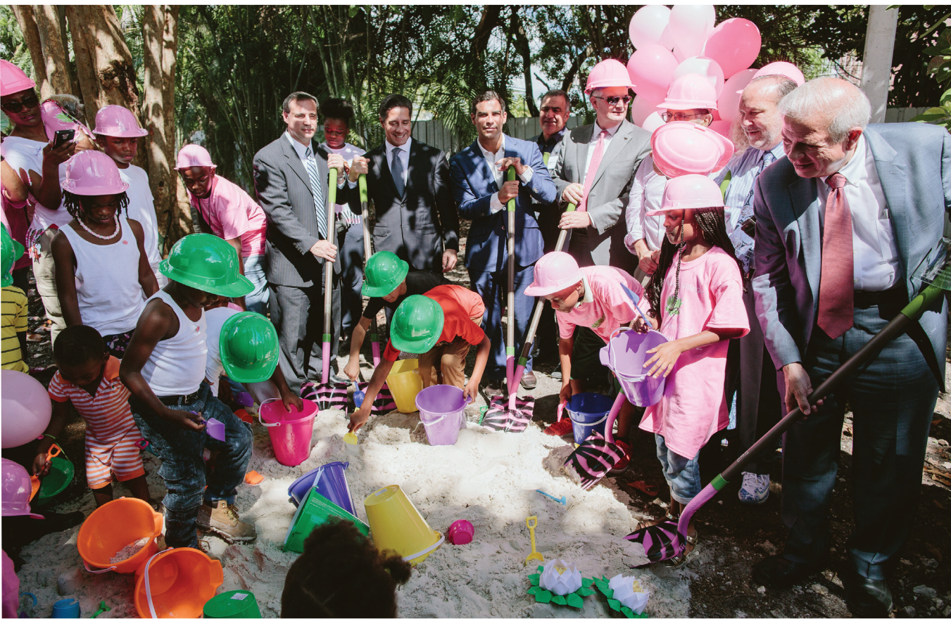
Lotus Village Breaks Ground September 15, 2016 ~ A Dream Come True!