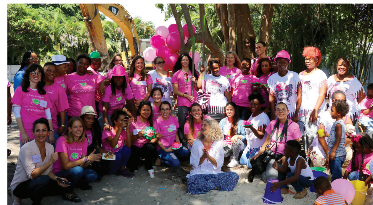
Lotus House staff LOVE the prospect of their new home creating more LOVE for generations to come!