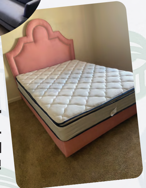
Photos taken by our team of our alumni's new apartments. Fully furnished with donations from Thrift!