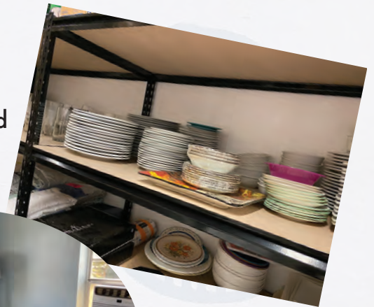
Household items in our Donation Center, used for moveouts

300+ alumni house- holds outfitted annually!