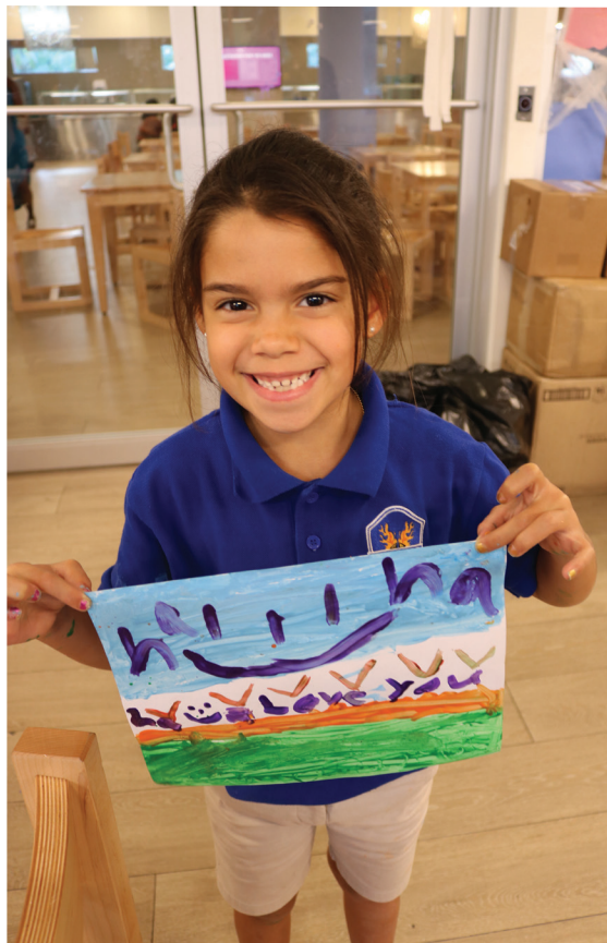
We love you! Thank you!

For children and families experiencing homelessness, whether due to violence, medical or mental health issues, disabilities, economic issues or other special needs, Lotus Village offers a multi-faceted, child centered framework for enriched supportive services, best practices and deep protective factors vital to transforming what would otherwise be yet another layer of trauma in the young lives of sheltered children and their mothers into a window of opportunity to heal, strengthen, and thrive. Your support makes this important work possible and is a life changing investment in our future. Thank you!