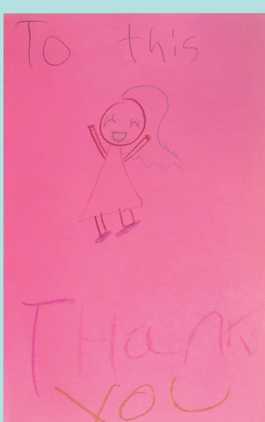
Thank You Letter, Lotus House Child