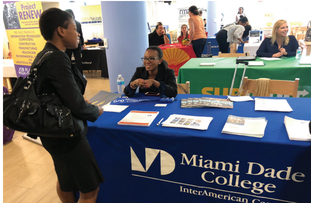
Job Fair in Micky and Madeleine Arison Family Foundation Pavilion

Violence is a leading cause of homelessness for women, and normative in the lives of women experiencing homelessness. All too often, impoverished women and their children are forced to remain in abusive relationships because they lack safe emergency shelter with supportive services, tools and resources to heal, reclaim their lives and build the foundation for a safer, brighter future. Over 95% of the women sheltered at Lotus House report histories of violence, many starting with victimization as children, and research shows that, without appropriate interventions and supports, the effects of violence are both life long and intergenerational.